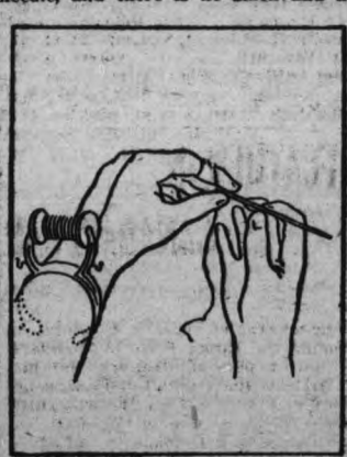
SPOOL CAN'T ROLL AWAY.

Women who do crocheting, knitting and other forms of needlework know how aggravatingly the yarn can tangle up and the spool, or ball, roll away. A Washington man has designed a bracelet spool that prevents all this. The spool is revolvably mounted on a bracelet, which opens at the bottom, and which can be clasped on the wrist in an instant. The yarn or thread feeds over the back of the hand into the needle, and there is no slack and no